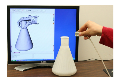
d) Grasping tasks performed in simulated environment using different hand models. For each case, the images also show the user providing the approach direction via a magnetic tracker.